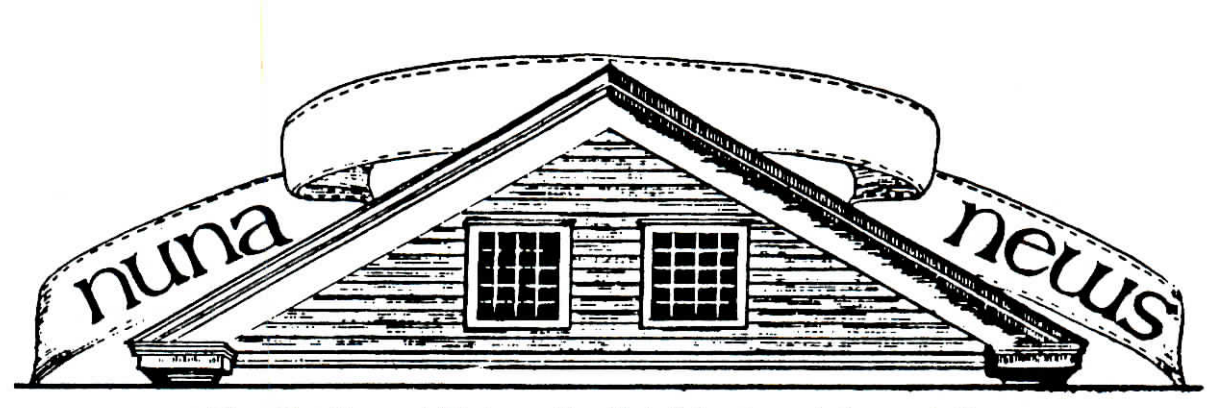
The Northwest University Neighborhood Association