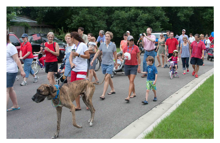
The whole neighborhood participated in the procession around Hemphill park.