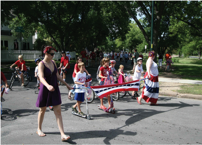
NUNA residents walk around Hemphill park during last year's July 4th parade.

stroller, scooter, bike or vehicle) to join in the fun. Meet at the corner of 32nd and Hemphill Park at 10am sharp on Sunday, July 4th. Our very own firefighters from Station #3 will be there to lead the parade. After showing all those other neighborhoods what patriotic looks like, hang out around the park bench for some refreshments and games (with prizes!)