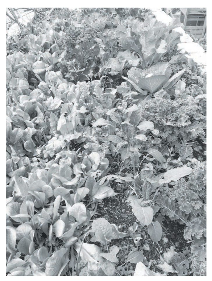
"Dong's Bounty: butter crunch lettuce, red speckle lettuce, kale, cabbage, beets, broccoli, mustard greens"

Doug's and Marianne's winter gardens were in full swing, then. At Doug's, butter crunch lettuce leaves crowded each other alongside two varieties of kale, pert heads of cabbage, robust red mustard leaves, spiky shallot greens, flowery fronds of fennel and asparagus, and enough parsley to freshen an army's breath. Marianne helped us explore her own sturdy stalks of Brussels sprouts, fountaining artichokes, trellised peas, leafy bok choy, and a big, beautiful head of broccoli.