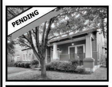
4012-B DUVAL STREET

Modern Craftsman-style townhome that lives and feels like single family. 2,050 SF with open floor plan, 3 BR, 2.5 BA, covered patio, 2-car garage, fenced yard.