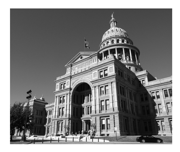
Texas State Capital Building

"Well, it turns out that he actually is a senator, a real live Texas senator! He took me up to the Capitol, showed me his office, introduced me to everyone we met. Then took me on a grand tour of that magnificent building—the red-carpet treatment! For me, just a stranger in town, I was impressed." So were we.