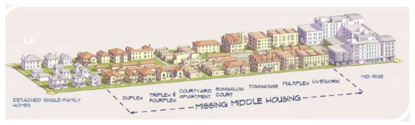
FIGURE C-1 (Source: Staff presentation at PC/ZAP Joint Session, November 28, 2017)